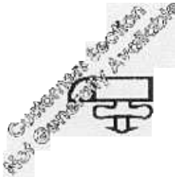
9.8 x 3.1mm Magnet